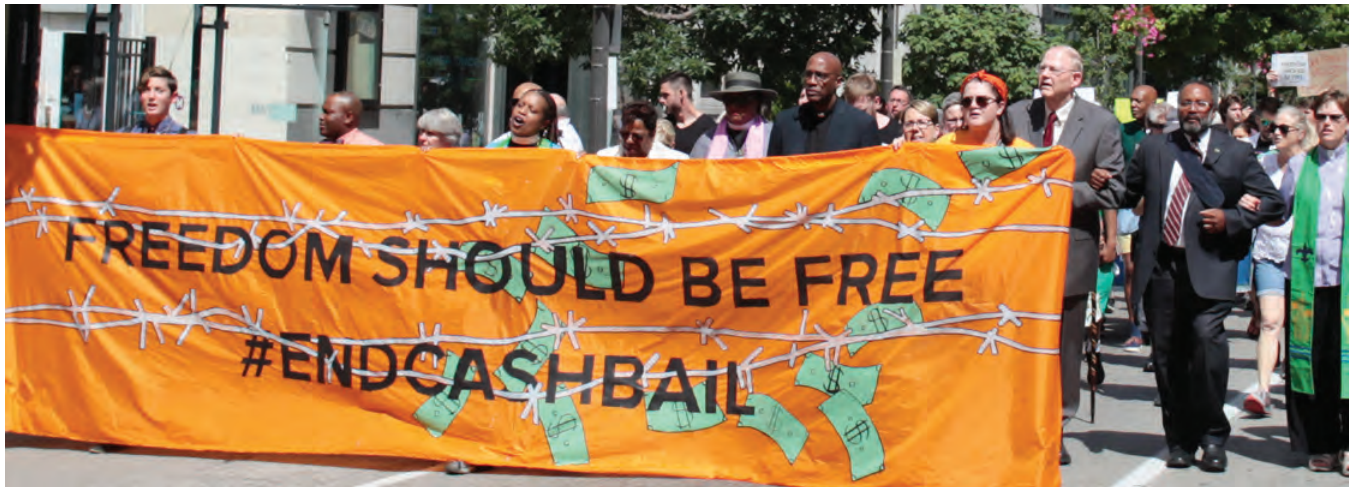
Presbyterians march in the "Freedom Should Be Free — No Cash Bail" rally at General Assembly 223 in St. Louis.